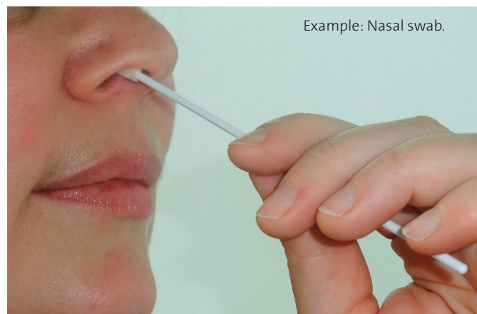
Example: Nasal swab.

Some people carry MDRO in or on their bodies without knowing, especially on particular parts of their skin or in their gut. These bacteria may pose a risk to you or other patients in the course of a medical intervention.